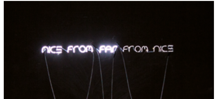
JAN KUCK NICE FROM FAR FROM NICE, 2015-17 NEON TUBES, PLEXIGLASS 60 X 160 CM EDITION OF 3 + 1 AP