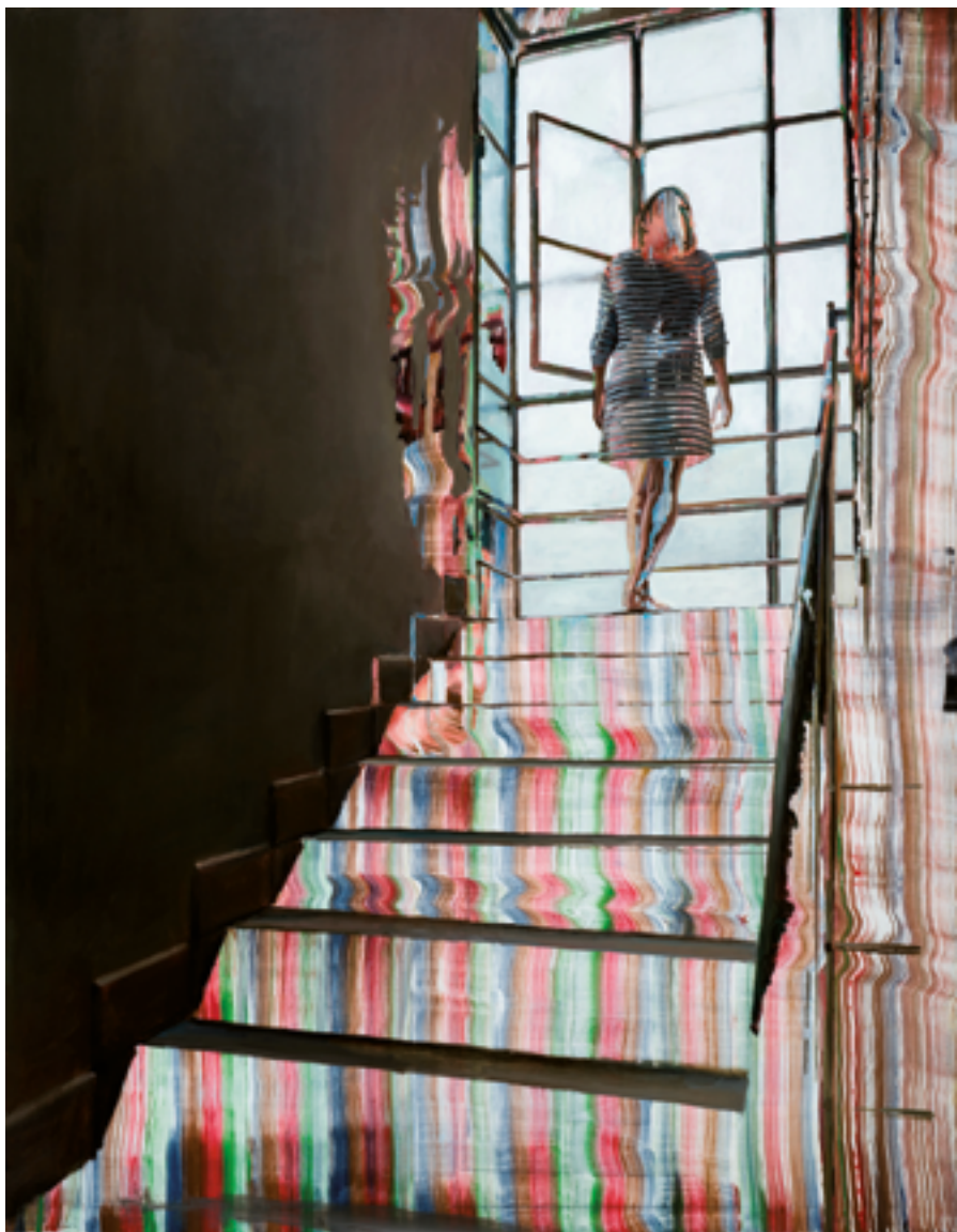
DÉNESH GHYCZY MORE THAN ELEVATIONS, 2016 OIL AND ACRYLIC ON CANVAS 160 X 125 CM