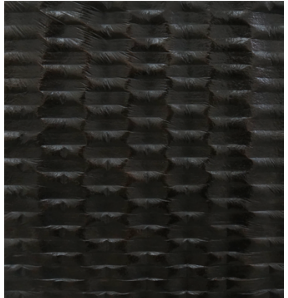
JIEUN LEE WIEDERHOLTE STRUKTUR 1, 2016-17 BRONZE 26,7 X 29,3 X 3 CM