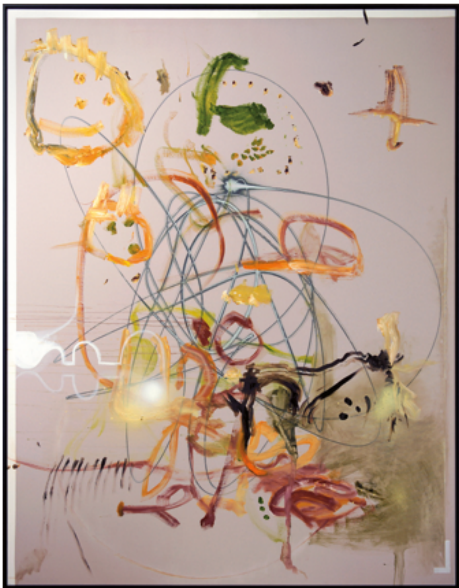
MARTIN DENKER O.T.(BOBASP), 2016 PIGMENT PRINT WITH OIL AND ACRYLIC ON CANVAS 180 X 140 CM UNIQUE