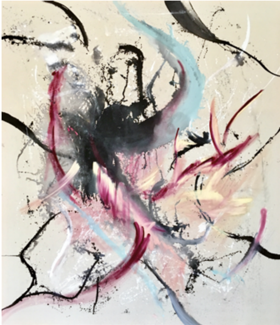
MAXIMILIAN MAGNUS MATHILDA NO 1, 2016 OIL AND ACRYLIC ON CANVAS 230 X 190 CM