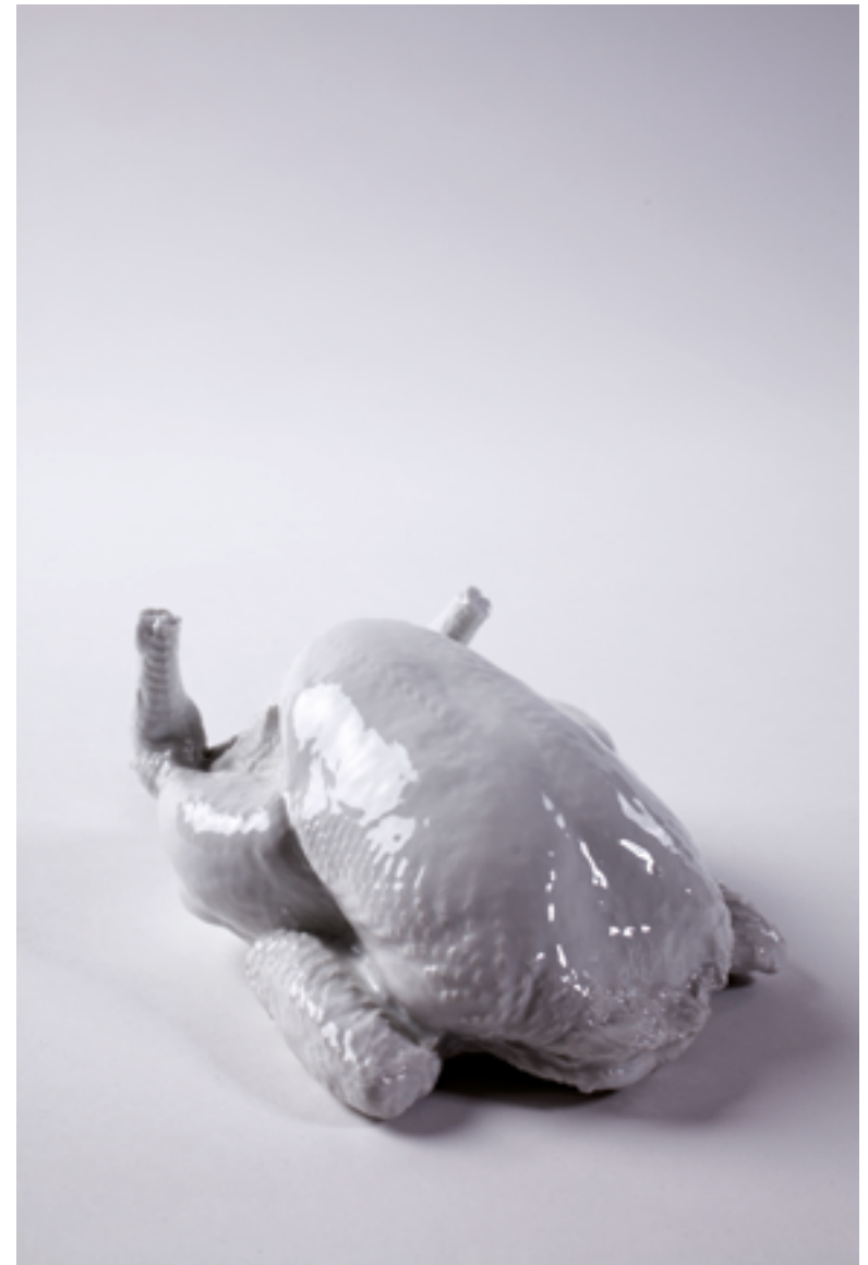
ARTÚR VAN BALEN SAINSBURY CHICKEN, 2011 PORCELAIN, CLEAR GLAZE 13 X 19 X 10 CM EDITION OF 92