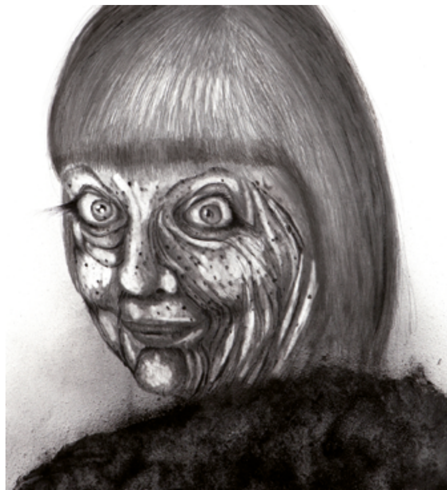
ROEY HEIFETZ THE SECRETARY, 2014 GRAPHITE ON PAPER 80 X 40 CM