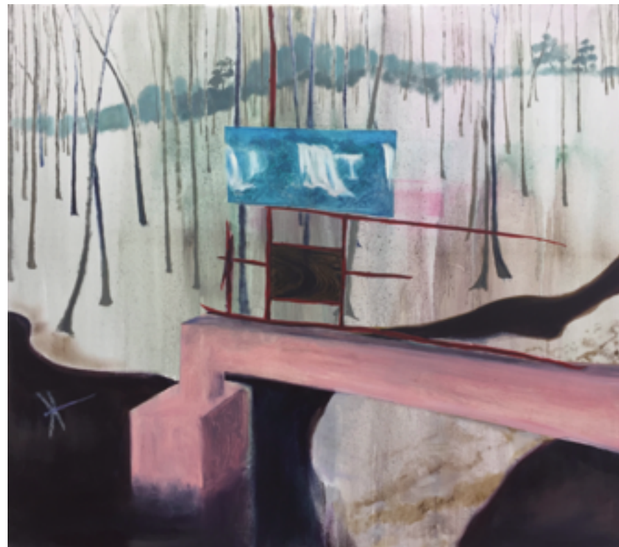
JULIA ADELGREN DUSTY THEY GROW, 2017 OIL ON CANVAS 115 X 130 CM