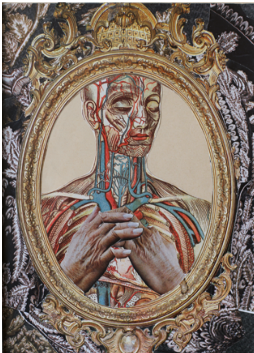
LUCIO PALMIERI CALENDAR OF SAINTS - HENRICH SEUSE (AMANDUS), 2014 MIXED MEDIA COLLAGE 32,5 X 23,5 CM