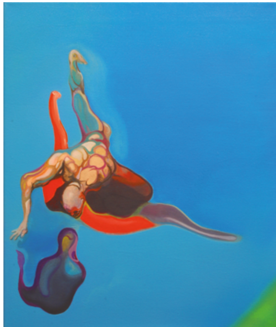
SVEN TÖLLE DROWN IN THE HOLE, 2017 OIL ON CANVAS 60 X 50 CM