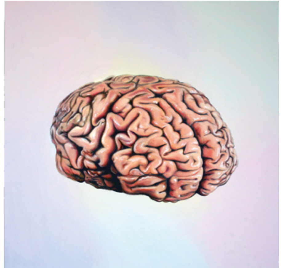
MEGAN J. ARCHER BRAIN, 2015 OIL ON CANVAS 50 X 50 CM