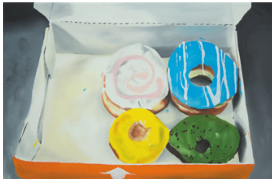
DENISE KIRSCH 6ER BOX OIL ON CANVAS 27 X 41 CM