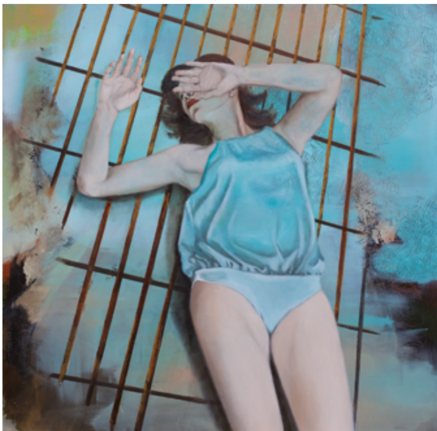
KERSTIN DZEWIOR POOL, 2016 OIL ON CANVAS 100 X 100 CM