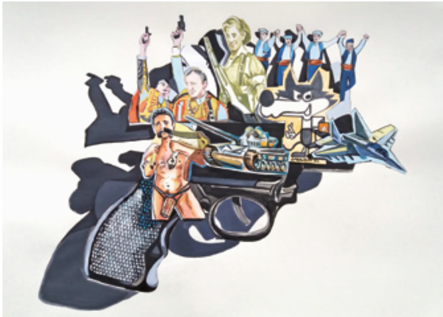
IRMA MARKULIN SCHATTENBILDER 1C, 2017 ACRYLIC AND INK ON PAPER 50 X 70 CM