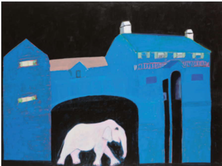
SONJA BLATTNER ELEFANT, 2015 ACRYLIC ON CANVAS 90 X 120 CM