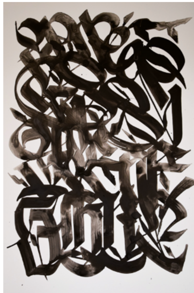
DRURY BRENNAN A DEEPER SHADE OF SOUL, 2017 INK ON STONE PAPER 42 X 28 CM