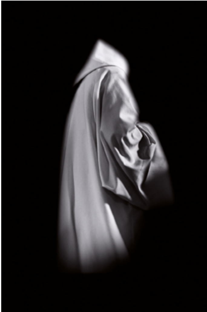
ORSA ETERNAL MEMORIES, 2011 FUJIFLEX PRINT ON HAHNEMÜHLE PAPER MOUNTED ON ALU DIBOND 190 X 120 CM EDITION