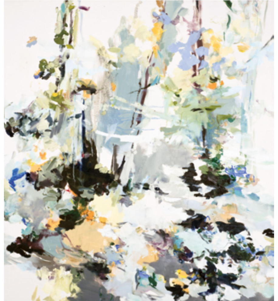
BEATE KÖHNE IN SILVA I, 2016 OIL ON CANVAS 200 X 170 CM