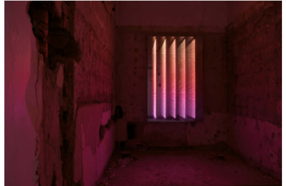
ALEXANDER DEUBL PRIVATE DANCER, 2017 MIXED MEDIA 88,7 X 64,6 X 11 CM UNIQUE