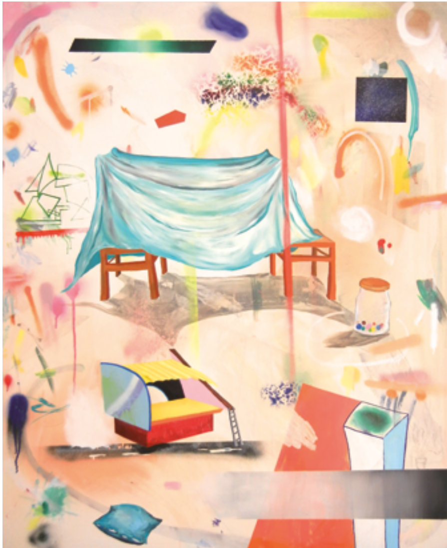
ANNA WEBER ATELIERBUDE, 2016 OIL AND VARNISH ON CANVAS 160 X 130 CM