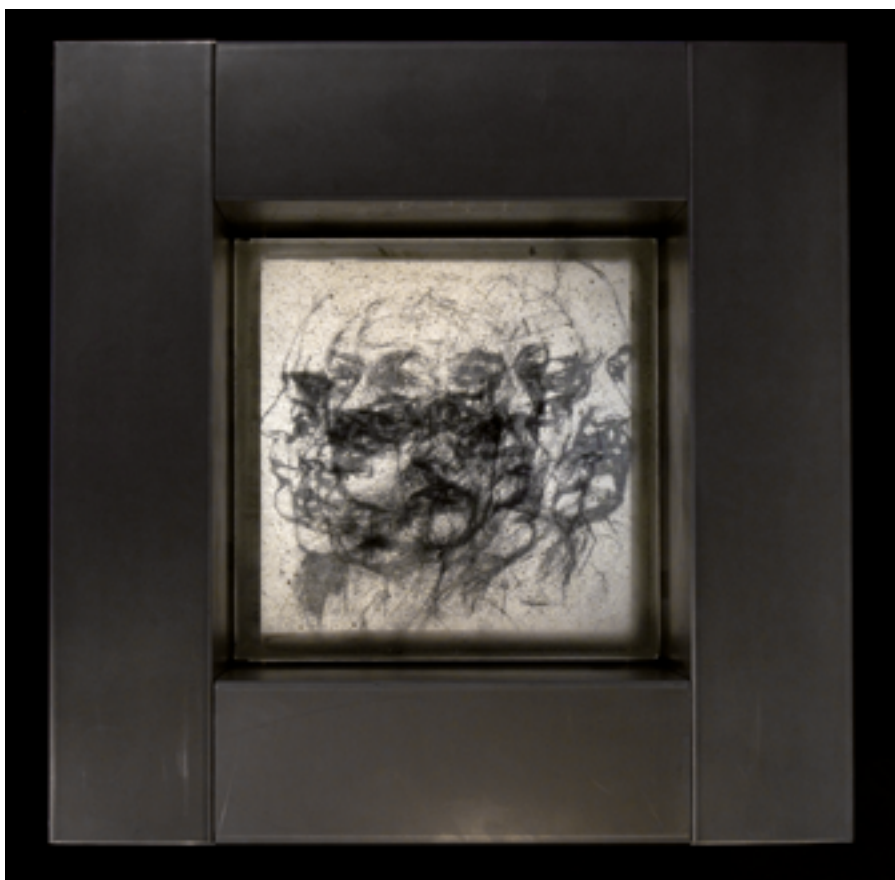
CLAUDIA VIRGINIA VITARI LE CITTÀ INVISIBILI LA MASCHERA, (VOLTII), 2010-12 SILKSCREEN ON GLASS CASTING WITH METAL AND LIGHT 50 X 50 X 50 CM