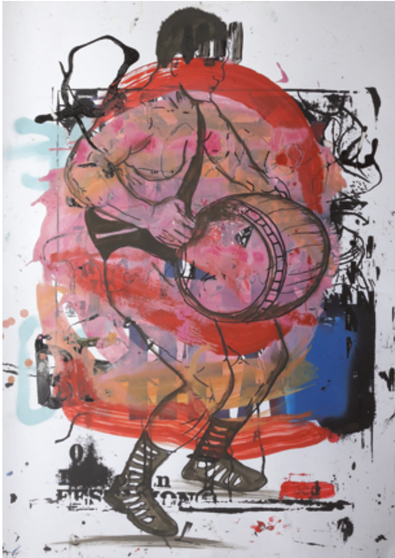
ANTON UNAI PERURENA, 2017 MIXED MEDIA ON PAPER 70 X 50 CM