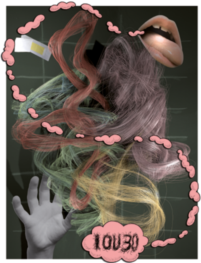
TIM BERRESHEIM HEARD BUT NEVER SEEN I, 2015 ULTRACHROME ON PAPER 56 X 44 CM EDITION OF 25