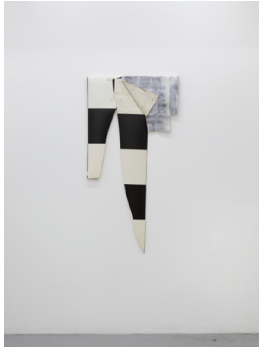
BEN GAVIN MARYLIN, 2016 MIXED MEDIA ON MARINE PLYWOOD 130 X 65 CM