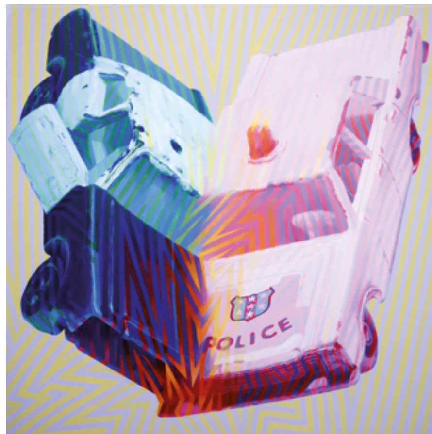
FRANCISCO CINTOLESI CALL THE POLICE, 2014 OIL ON CANVAS 160 X 160 CM