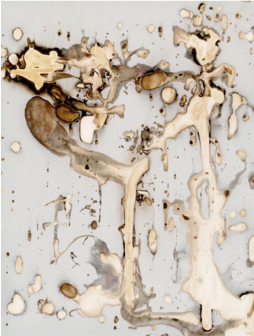
ELENA TERNOVAJA THE ALCHEMY OF THOUGHTS I, 2015 CHEMIGRAM, INKJET PIGMENT PRINT ON HAHNEMÜHLE PAPER 80 X 60 CM EDITION OF 10